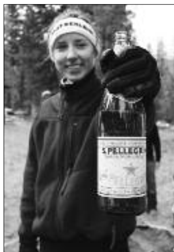
A prize for every rider.