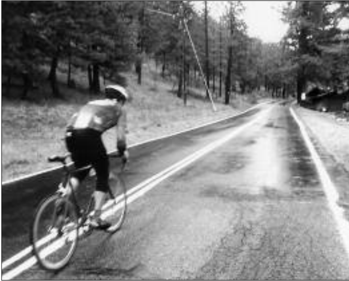
The Hill Climb course hasn't changed in thirty-two years.

Missoulians On Bicycles (MOBI) invites you to take part in what is Montana's oldest annual competitive cycling event. The Hill Climb traditionally closes Montana's bicycle racing season, but it